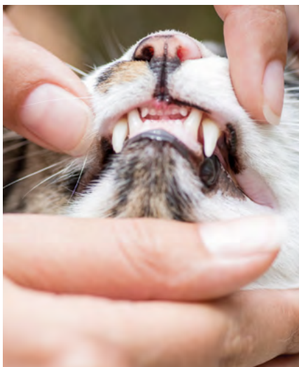
A thorough physical examination, including of mucous membranes, can help veterinarians spot hydration issues and potential problems in feline patients.

I look for skin tenting and sunken eyes and examine the cat's mucous membranes to determine if the cat is severely dehydrated. During the examination, I also ask clients about changes in the size of the cat's litter clumps. If they are drinking more water, are they also increasing their outputs in the litter box or is urine output decreasing? Weight loss also increases my concern about hydration as does diabetes or another polyuric/polydipsic process because these cats may not be able to drink the amount of water they require.